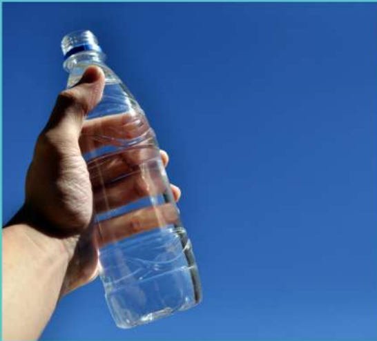
a bottle of water

We often use expressions of quantity with uncountable nouns.