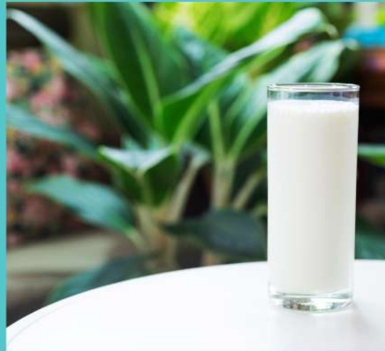
a glass of milk