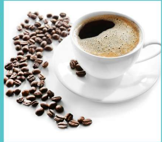
a cup of coffee