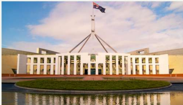
Top: Sydney hot air balloons Bottom: Parliament House

Canberra is the capital city of Australia and its eighth largest city. Canberra is home to many Federal buildings, including the Parliament House, the High Court, and the War Memorial. Many people choose to see the city in a hot air balloon, giving them a fantastic view of the historical buildings. Canberra became the capital because Melbourne and Sydney kept fighting over which one of those cities should be the capital. They compromised and agreed to have the capital city between the two cities.