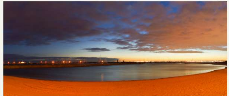
FINDER Street train station, Eureka Tower, and St. Kilda Beach