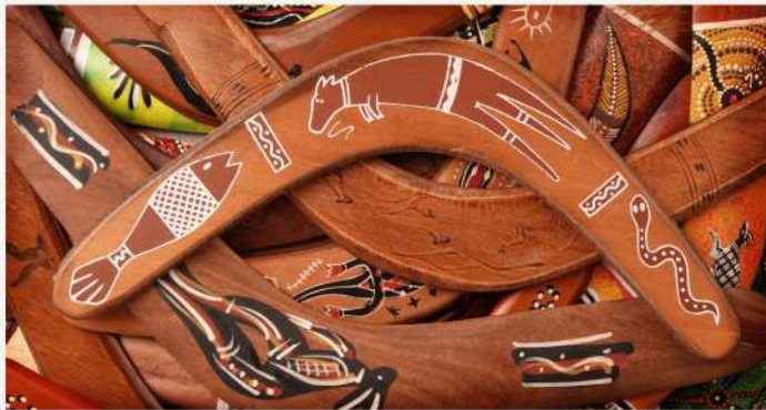
Top: spears Bottom: boomerangs

The first people who lived on the continent were the Aboriginal and Torres Strait Island Peoples. They invented the spear and the boomerang and lived in the Outback, a desert covering about two-thirds of the land. They arrived on the continent from the Indonesian islands almost 60,000 years before the British settlers in 1776. Other colonists came to the country because of the discovery of gold. Today, only 2% of the population are Aborigines.