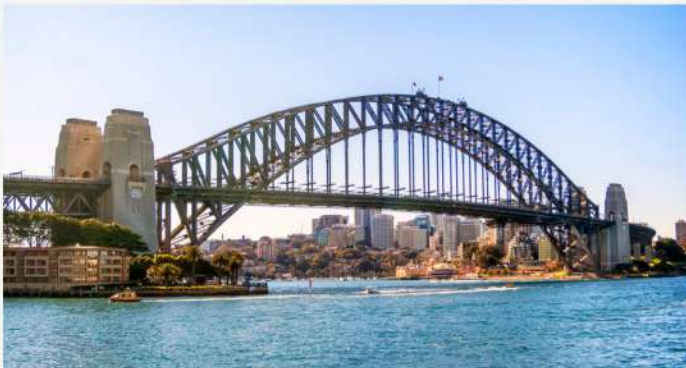
Top: Sydney Opera House Bottom: Sydney Harbour Bridge

Sydney is not the capital of Australia, but it is the most famous and populous city in Australia. Sydney has many attractions, such as the famous Sydney Opera House. It is an incredibly iconic building. Another remarkable structure is the Sydney Harbour Bridge, nicknamed The Coat Hanger, which is over 122 m (400 ft) tall and 500 m (1,640 ft) long. People can even climb up to the very top! Sydney also has incredible landscapes, beautiful beaches, nightlife, and museums.